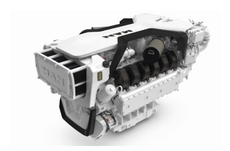
MAN V12X: The "X" stands for the neXt generation of engines from MAN Engines with eXtra displacement – 30 litres – and an eXcellent power-to-weight ratio.